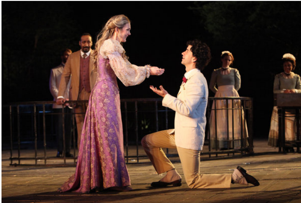
Lily Rabe and Hamish Linklater in “The Merchant of Venice” in Central Park, where they will return in “Much Ado About Nothing.”