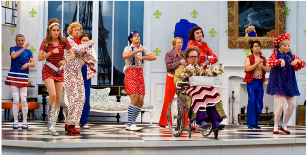
Molière’s “The Imaginary Invalid” at the Idaho Shakespeare Festival.